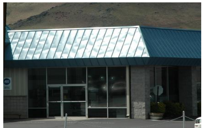
(Above and Right) These photos are minutes apart. The only difference is camera angle.