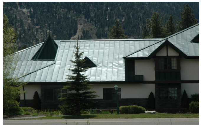
(Above and Right) The only difference is an hour in time and the changing the angle of the sun