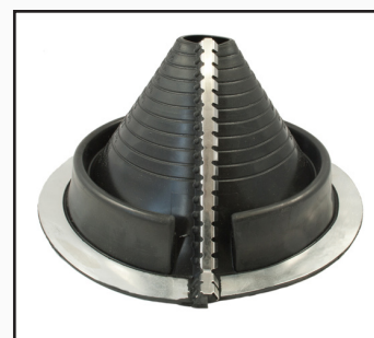
DEKTITE RETROFIT BLACK EPDM

Fasten Dektite® to surface with long-life, self-drilling fasteners. Apply additional sealant around base if desired.