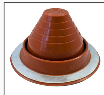
DEKTITE ORIGINAL RED SILICONE